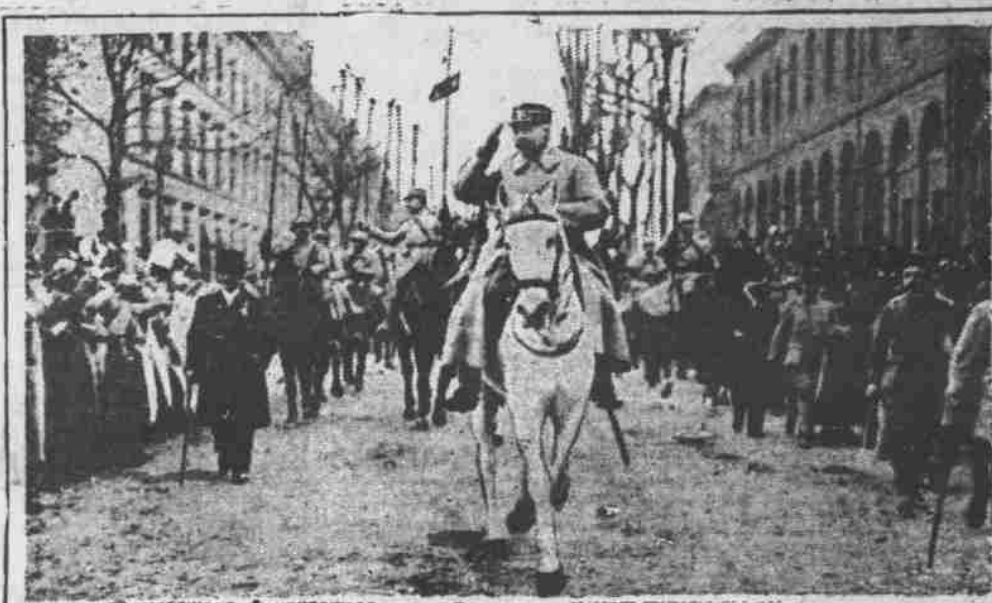
This is the first photograph of Petain entering Metz, at the head of the victorious French army after the armistice. Metz is the chief city of the Alsace-Lorraine region handed over to the French under the armistice terms. Germany took Alsace-Lorraine away from France in 1870.