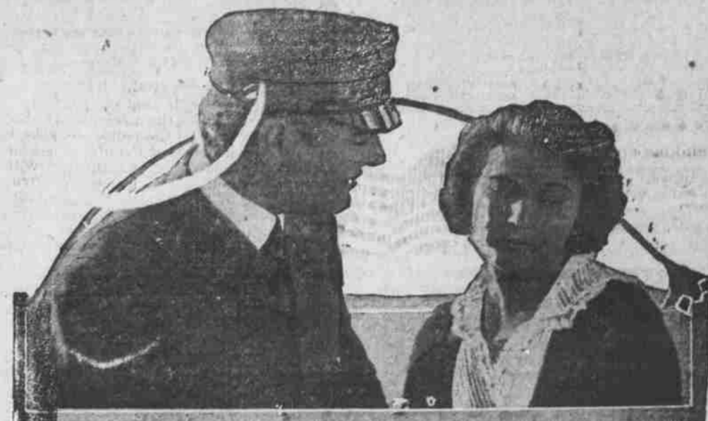
THOMAS H. INCE presents DOROTHY DALTON in "The Kaiser's Shadow" A Paramount Picture