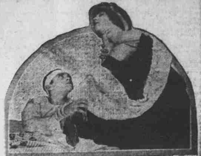
JACK PICKFORD in Mile a Minute Kendall A Paramount Picture

A rip-roaring, go-get 'em Comedy Drama. Full of pep and one that will make Jack Pickford now of the U. S. navy, more popular than ever. Action! Thrills! Be sure and see Sailor Jack in Mile-a-Minute Kendall.