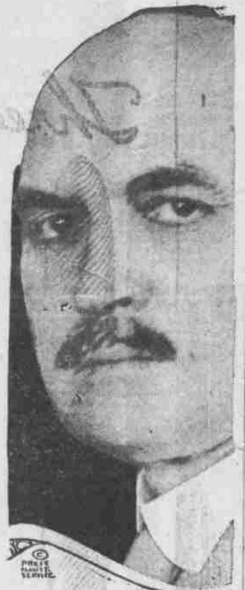
DAVID P. HOUSTON

Houston, secretary of agriculture, may succeed McAdoo who has resigned from the position as secretary of the treasury. Houston is a Missourian.