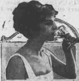
ELSIE FERGUSON in "The Danger Mark"

Miss Ferguson portrays this difficult role with discretion, taste and skill. Her emotional scenes are described as being most artistic and they lend much charm and interest to a most captivating story. The love interest is exceptionally strong and this is perhaps the chief charm of the photoplay. Miss Ferguson is capably supported by an excellent company.