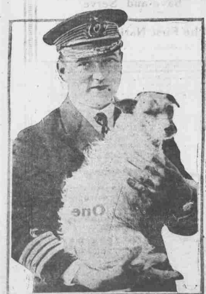
CAPTAIN GORDON CAMPBELL

This is Captain Gordon Campbell, to whom was awarded the "mysterious V. C." and his mascot. Of the thirty recipients of that honor up to February, 1917, when he was decorated, he was the only one in which the specific act meriting the V. C. was not mentioned. The British admiralty has just announced that Captain Campbell was commander of several of the Q-boats which masqueraded as tramp steamers and other harmless craft. In one action his ship sunk a U-boat. In another his Q-boat was lost.