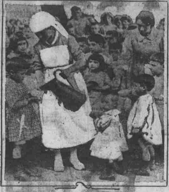
CHILDREN UNDER RED CROSS CARE GATHER FOR BOWL OF

CHILDREN OF FRANCE ARE BROUGHT BACK TO HEALTH.