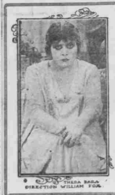
THEDA BARA DIRECTION WILLIAM FOX

The scenes were taken on actual battlefields and the soldiers are not actors of the company but men who fought thru the real battles of the war.