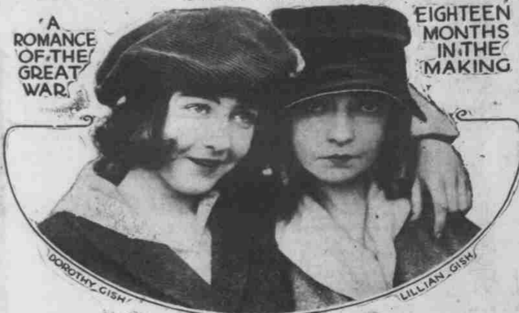
A ROMANCE OF THE GREAT WAR.