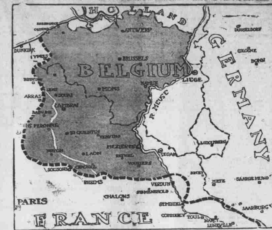
A Berlin report says it is rumored that the Germans are planning a great retreat to the line of the Meuse in France and Belgium. It sounds to a good to be true, but you can't tell what Marshal Foch has up his sleeve. The shaded portion of the map shows the vast expanse of French and Belgian soil the Germans held west of the Meuse before the last allied smash. Foch has already forced them back for a good start on this retreat—there the allies are fighting for.

are both supporting the same country and the same cause—our army in one way, ourselves in another. There is the hard part, but at least we can do our part as promptly and loyally and efficiently as they do theirs.