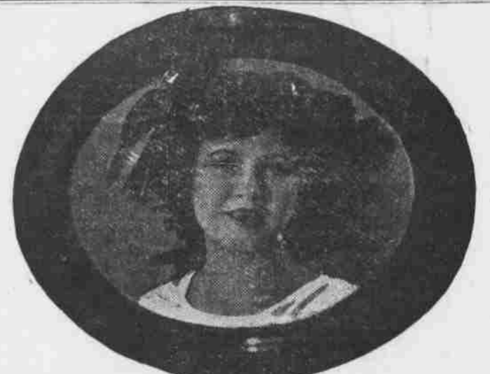
MARGUERITE CLARK in Rich Man, Poor Man AT THE PASTIME.

THE MOST IN VALUE The Paris THE BEST IN STYLE PENDLETON, OREGON