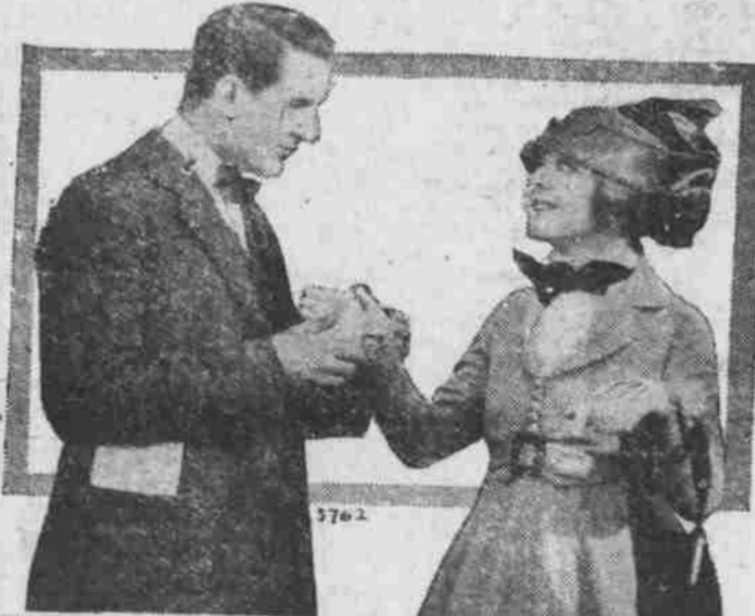
Thomas H. Ince presents ENID BENNETT in "Naughty, Naughty!" A Paramount Picture. AT THE ALTA TODAY.

Herald. He recently died, a famous man, in New York. A comprehensive "Life of the Post Scout," was written many years ago by one of the present members of the Bulletin staff.