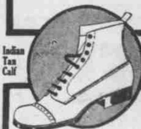
Indian Tan Calf

The moment you put it on you say "Hello" to comfort and "Good-bye" to cramped toes, crowded feet and the other foot troubles that mar your comfort and your peace of mind. Here it is—take a good look at it: