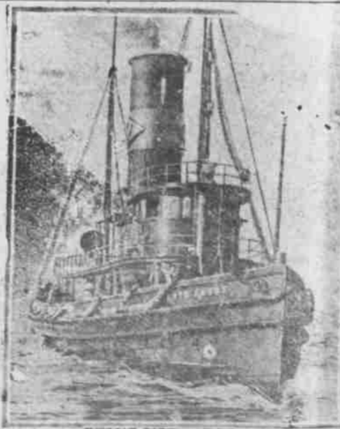
TUGBOAT, PERTH, AMBOY