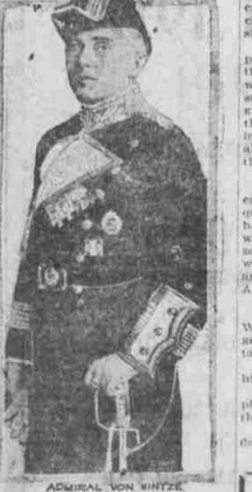
Admiral von Hintze is the new secretary for foreign affairs chosen by the Kaiser in place of Secretary von Kuehlmann, whose recent speech before the Reichstag made it impossible for him to continue in office.