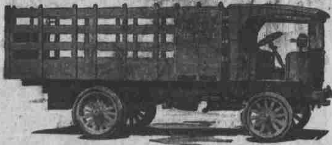
GARFORD GARFORD 3 1/2 TON CAPACITY