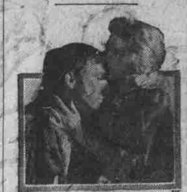
William S. Hart 'The Tiger Man' Advertiser

At the same time, the city council adopted a resolution energetically protesting against reduction of the bread ration.