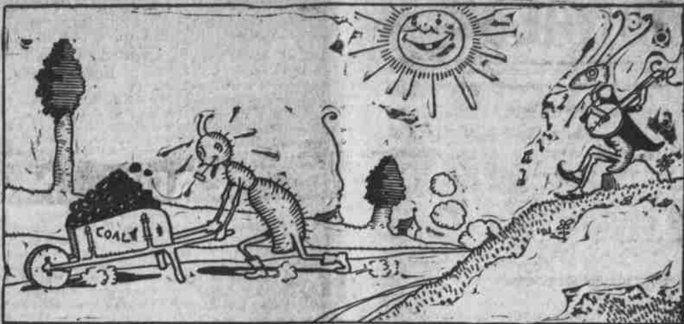
One Fine Day in Summer a Thoughtful Old Ant Was Busy Getting in His Winter's Coal Supply, the Roadside a Grasshopper Was Singing away to Beat the Band.