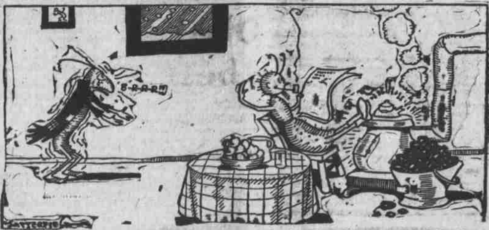
When the Cold Winter Came Old Man Ant Was as snug as a Bug in a Rug. Along Come Friend Grasshopper with a Hard Luck Yarn About Freezing to Death. You Know the Rest. DON'T BE A GRASSHOPPER.