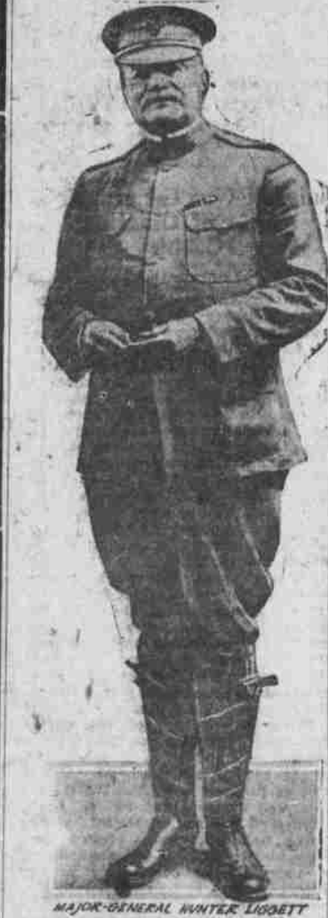
MAJOR-GENERAL HUNTER LIGGETT

General Hunter Liggett, who has been a fighter in the United States army for many years, is to command the great army under General Pershing is organizing for the western front, according to reports from Paris. General Liggett did valiant fighting in Cuba during the Spanish war and later in the Philippine islands.