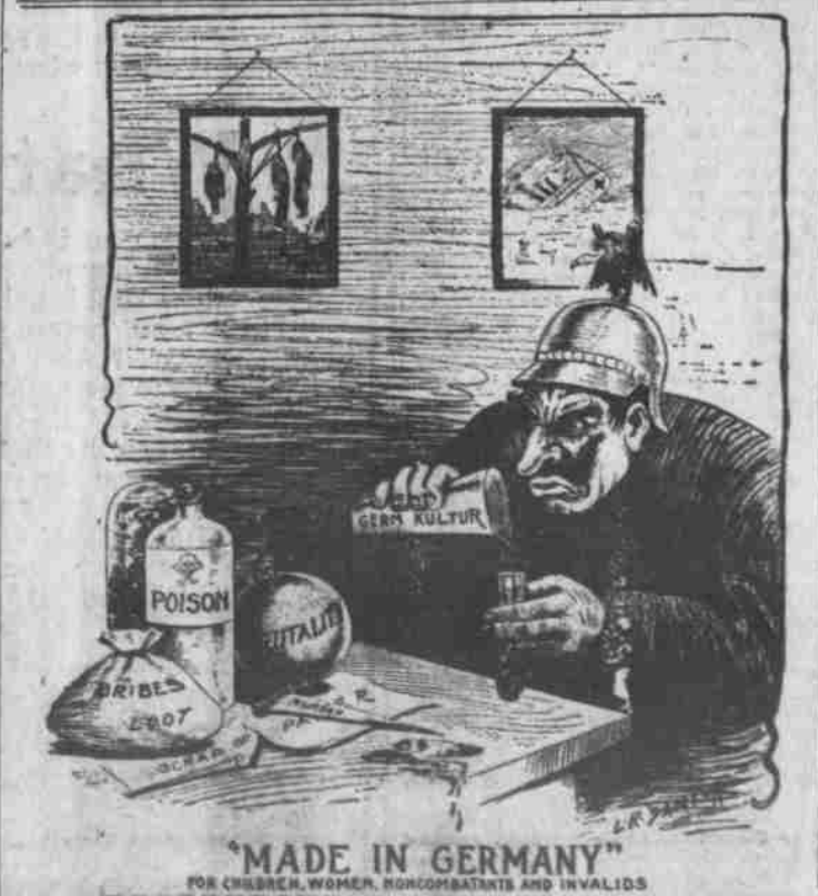
MADE IN GERMANY FOR CHILDREN, WOMEN, NONCOMBATANTS AND INVALIDS