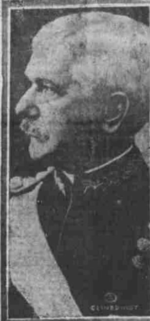
MAJOR-GENERAL WILLIAM C. GORGAS This is the latest photo taken of Major-General William C. Gorgas, surgeon general, who keeps the army of the United States healthy.

LATEST PHOTO OF DOCTOR WHO KEEPS ARMY HEALTHY