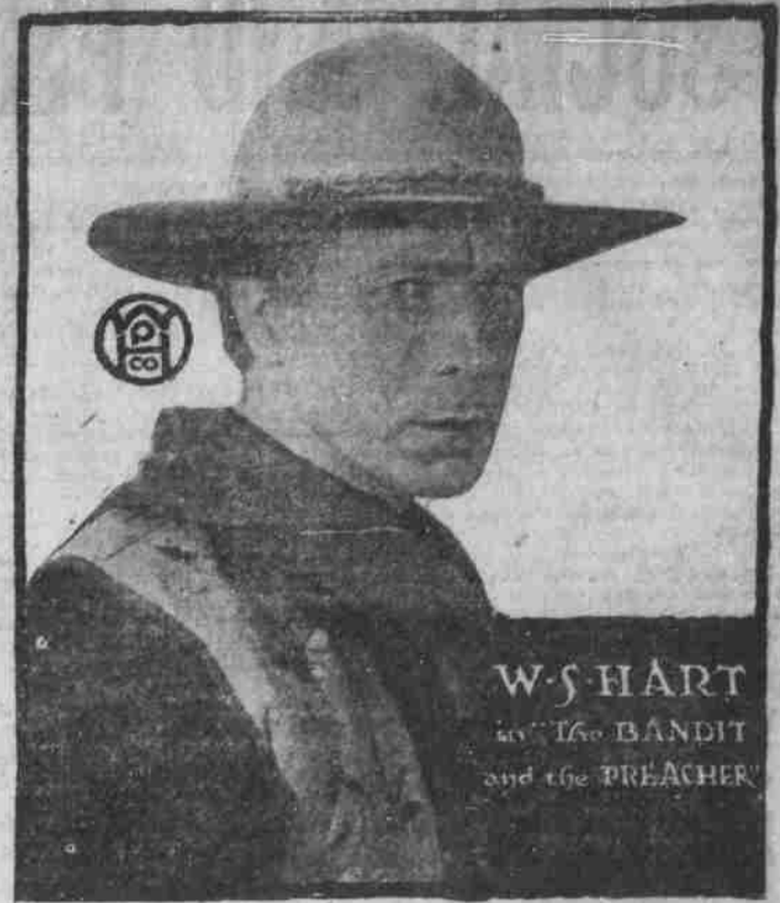
W. S. HART in "The BANDIT and the PREACHER"

If we sell you Groceries they are fresh and good