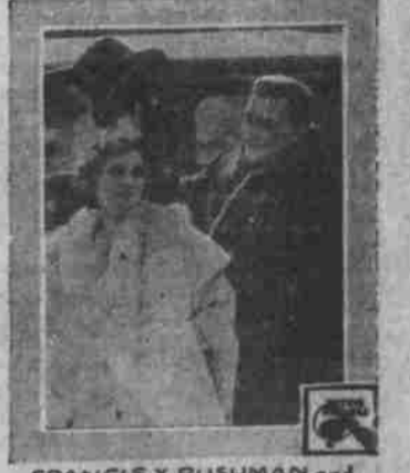
FRANCIS X. BUSHMAN and BEVERLY BAYNE in "RED, WHITE AND BLUE BLOOD"