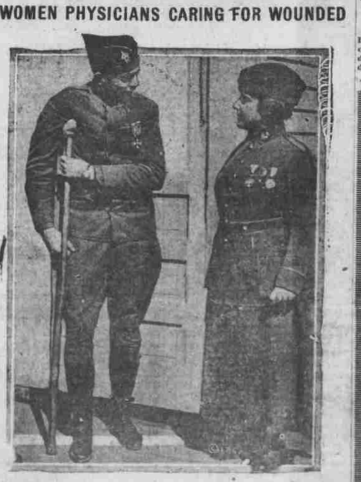
More than 2,000 women physicians wounded soldiers in France. This photograph was taken at one of the hospitals established by the organization in the United States, where several wounded soldiers are being treated.