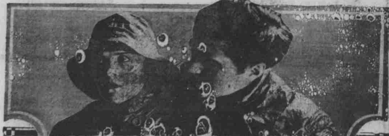
MAE MARSH IN "THE BELOVED TRAITOR," ALTA THEATRE SUNDAY AND MONDAY.