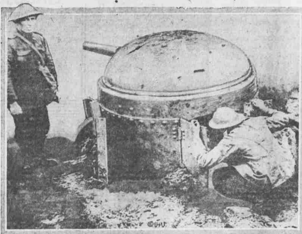
GERMAN ANTI-TANK GUN CAPTURED BY ANZACS