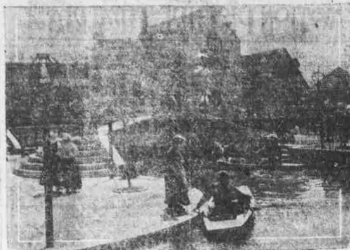
BESSIE BARRISCALE IN TRIANGLE PLAY, "WOODEN SHOES" PASTIME TODAY.

The Pacific Express Company has made a general reduction in rates since February 17.