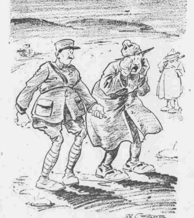
"Oh! Herb! What's the French for camouflage?"