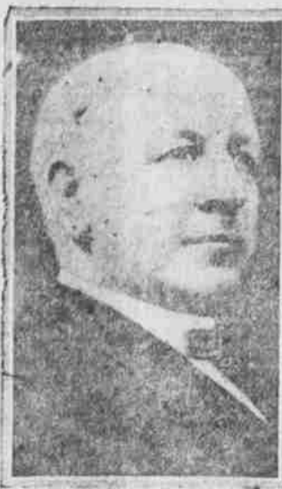
GOV. WM. D. STEPHENS

After delivering at Los Angeles a zealous attack on enemy agents and enemy propaganda in the United States an attempt was made on the life of Governor William D. Stephens of California at the executive mansion in Sacramento. A bomb was thrown against the building or planted so it exploded tearing away a part of the rear. The governor was not injured and all others in the mansion escaped.