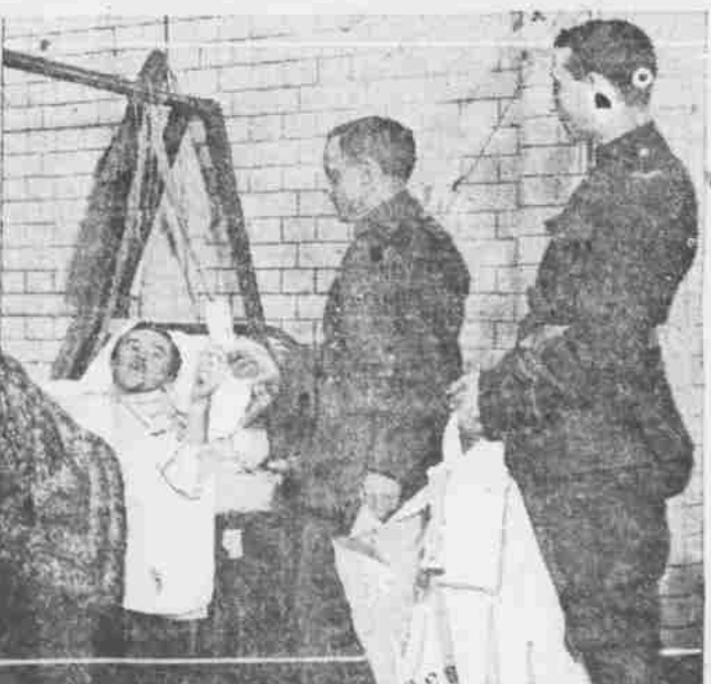
A wounded Canadian soldier in a hospital behind the lines in France is shown here taking the oath before casting the first vote in the Canadian election. The soldier voted early in December because of the time necessary in getting the ballots back to Canada. The ballots were collected in a mail sack.