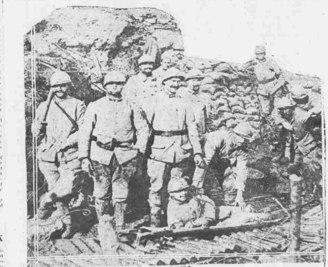
This photograph taken during recent fighting in Belgium shows the telephone operators at a French central station made out of a captured German concrete shelter, caring for two wounded soldiers who were struck in the legs by shell fragments and missed by the ambulance corps. The Belgium battle front has Atlantic City the less by shell fragments and missed by the ambulance corps. The Belgium battle front has Atlantic City the less by shell fragments and missed by the ambulance corps. The foreground is the war variety, laid over shell holes and almost impassable Flanders mud.