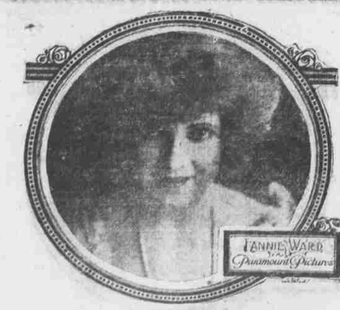
FANNIE WARD Paramount Pictures

A considerable decrease in the British casualties is shown in three figures. The casualties for the week ending Dec. 12 were 17,874; for the week ending Dec. 11, 23,256; and for the week ended Dec. 4, 25,372.