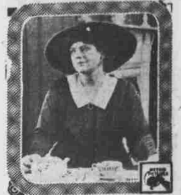
ETHEL BARRYMORE IN "THE LIFTED VEIL"