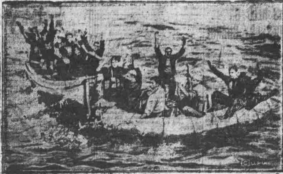
The crew of a British vessel sunk last, to the U-boat that torpedoed at sea surrendering after they had them. The picture was outlined in taken refuge on life-boat and life-boat.