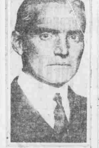
FRANK L. POLK, Counsellor of the State Department, may become the first Under Secretary of State of the United States. Great Britain has always had such an office. In the budget submitted to the house by the Secretary of State it was asked that the title "Counsellor of the State Department" be changed to "Under Secretary of State."

Frank L. Polk, Counsellor of the State Department, may become the first Under Secretary of State of the United States. Great Britain has always had such an office. In the budget submitted to the house by the Secretary of State it was asked that the title "Counsellor of the State Department" be changed to "Under Secretary of State."