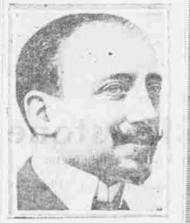
ROME, Nov. 29.—Gabriele D'Annunzio, the great Italian poet, who has been an officer in the Royal Aviation Corps, has been reported missing following a recent flight over the Austro-German lines in northeastern Italy. He was one of the members of a raiding squadron, the rest of which returned safely.