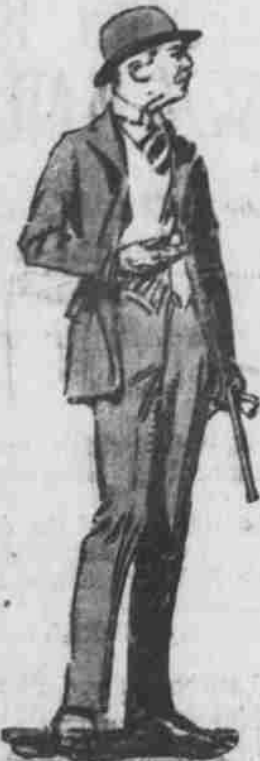
Copyright Hart Schaffner & Marx. Total satisfaction guaranteed; money cheerfully refunded.

The right clothes help the looks and the feeling, too; you can dress in smart style always, and the fact that your clothes are stylish and fit you, helps a lot toward the youthful spirit. Even when a man adds weight as he adds years, there are clothes-styles that are designed to keep up the idea of youthfulness. We have them here for you.