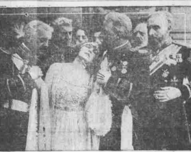
LOUISE GLAUM IN TRIANGLE PLAY, "SWEETHEART OF THE DOOMED."