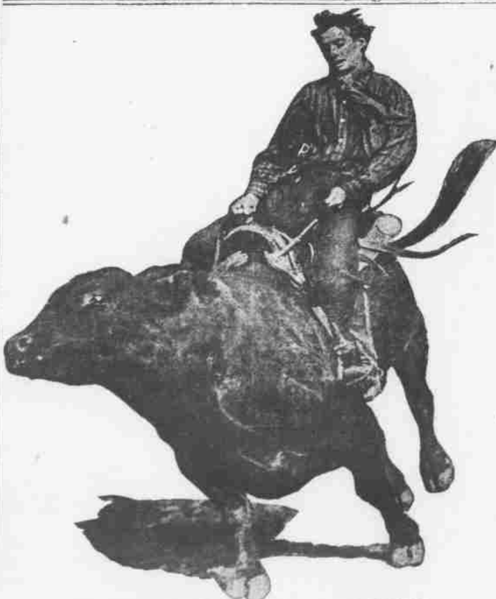
ON THE HURRICANE DECK OF SHARKEY

TOO MUCH HARD CIDER. An Ashland editor, who was full of hard cider, got a sale bill and a marriage mixed. The description was as follows: