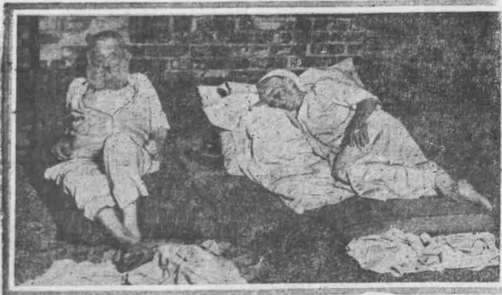
A typical roof scene in New York's East Side, the Ghetto of the city during the hot spell which sent New Yorkers in desperation to the roofs, fire-escapes and benches.