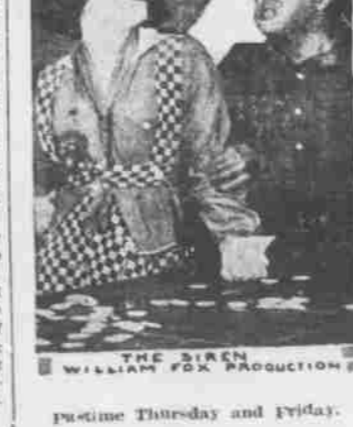
William Fox Production. Pastime Thursday and Friday.

German submarines destroyed by armed merchantmen and American destroyers show a tendency to grow in numbers like Sir John Falstaff's rogues in bunkrum.