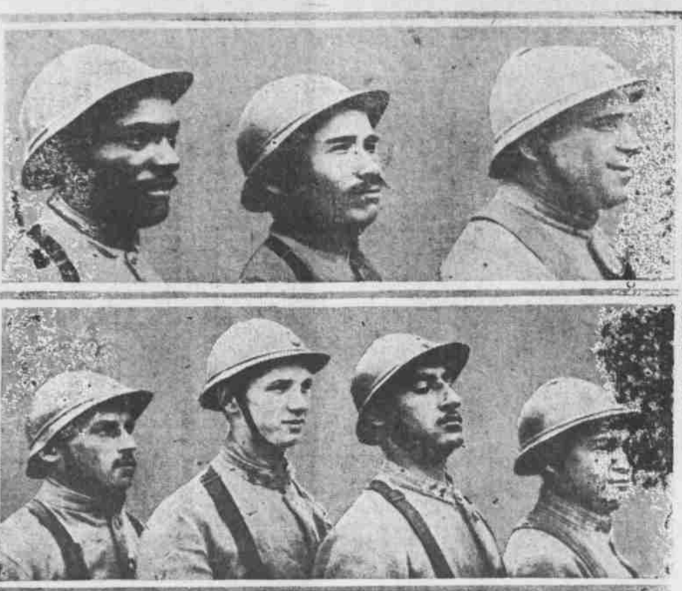
FOREIGN LEGION TYPES.

Here is an interesting study in nationalities. It shows the various types represented in the famous fighting Foreign Legion of France.