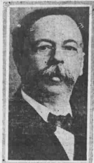
SENATOR CHAMBERLAIN That there are spies in the navy

department is the opinion of United States Senator George E. Chamberlain, of Oregon, chairman of the military affairs committee of the senate. Senator Chamberlain made this assertion on the floor of the senate, and added that if these spies can be found they must either be shot or hanged. Senator Chamberlain says he feels certain that information regarding the Pershing expedition to France reached Germany from spies in America and that these spies have aids in the navy department.