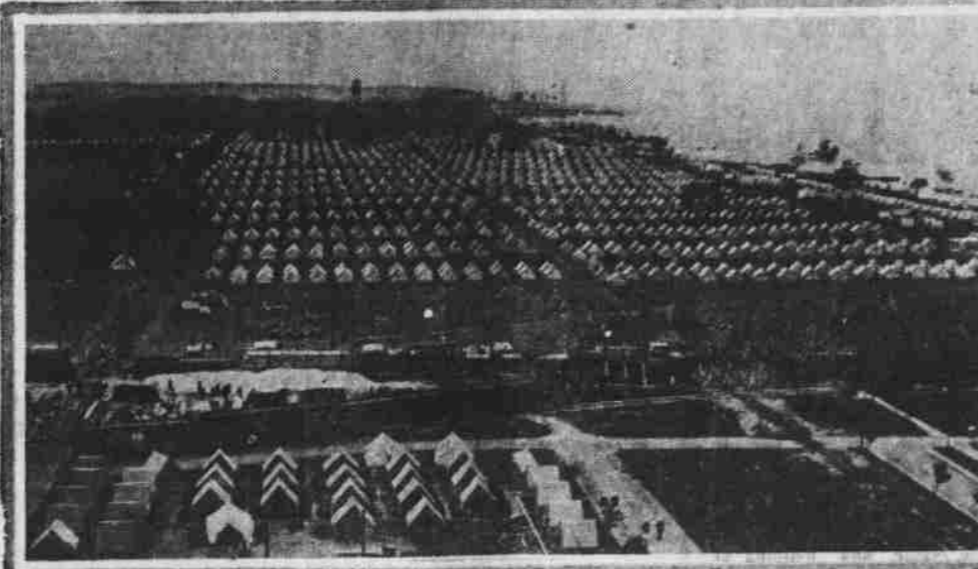
GREAT LAKES TRAINING STATION

The above photograph shows a remarkable view of the Great Lakes Training Station at Lake Huron, Ill., where several thousand young Americans are being prepared for active service in the United States Navy.