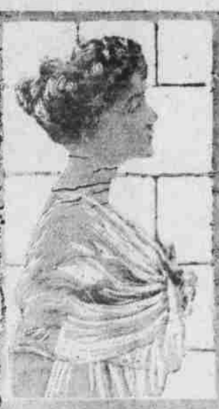
Mrs. Ava Willing Astor.

Mrs. John Astor, first wife of John Jacob Astor, who spends most of her time in London, has been busy with charitable work in helping British soldiers. This is the first photograph of her taken in some years, in fact since her former husband was lost in the wreck of the Titanic.