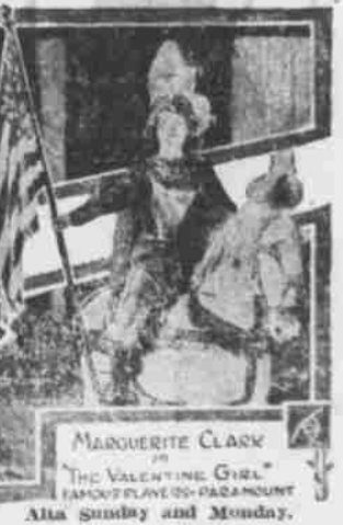
MARGUERITE CLARK in 'THE VALERIE GIRL' FAMOUS FLAVO-TO-PAGANINI. Alha Sunday and Monday.

PETROGRAD, June 29.—Major General Scott is the chief military member of the American mission, touring the Russian front. Former Senator Root of the civilian committee will remain a short time at the headquarters. The American party reached General Brusiloff's headquarters yesterday. While in Moscow it became known Root was forced to go to a hospital for treatment for a severe cold. Root made five speeches in one day with the temperature 105. He has entirely recovered.