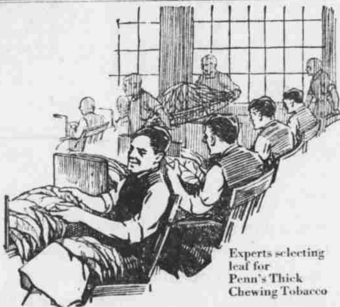
Experts selecting leaf for Penn's Thick Chewing Tobacco

Manufacturing Expert of The American Tobacco Company and a famous authority on the manufacture of chewing tobacco.