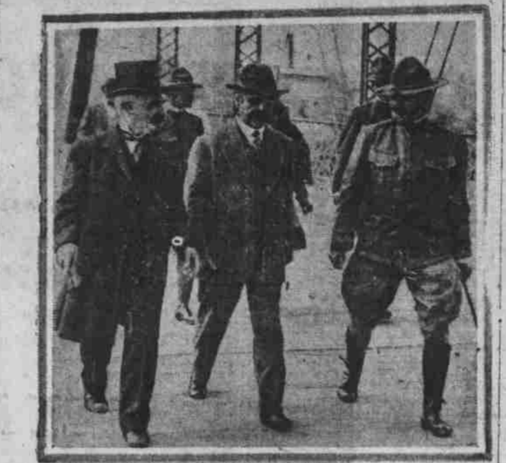
MEXICAN AMBASSADOR ARRIVING