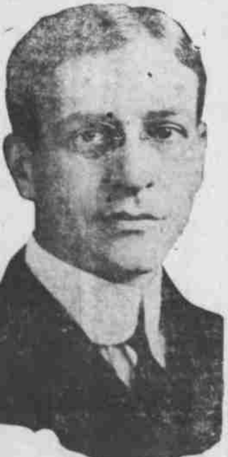
Secretary of War Newton D. Baker.