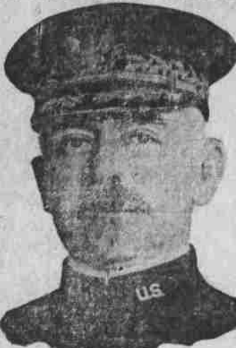
Major General Thomas H. Barry.