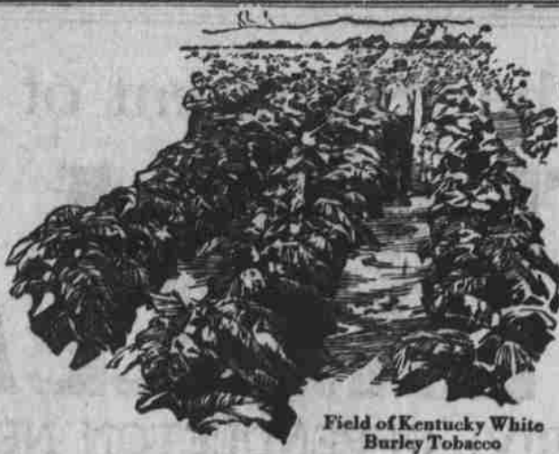
Field of Kentucky White Barley Tobacco

If your dealer does not carry Penn's Thick send ten cents (10c) in stamps and give us the name of your dealer, and we will send you a 10c cut and a leather pouch in which to carry it. Tobacco Company of California, No. 1 South Park, San Francisco, California.