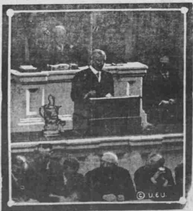
This photograph shows President Wilson reading his message before both houses of congress in the hall of the House of Representatives.