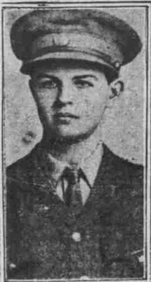
MARQUIS DE BLANDFORD