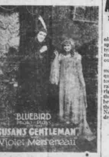
Bluebird Photo. Susans Gentleman Violet Methyleneau

A large number of flowers have already been photographed for use in Professor Sweetser's extension lectures, and of these he is making duplicates. This library of negatives, he hopes, will eventually contain all of the most important Oregon flowers. The series now under preparation are to be sent out when the flowers are in bloom.