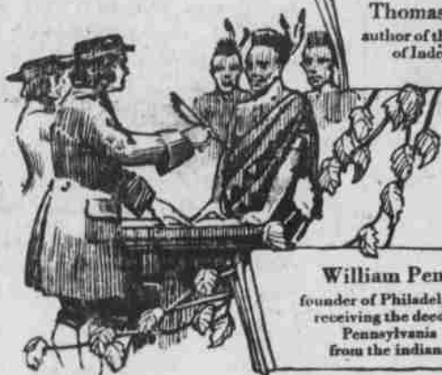
William Penn founder of Philadelphia, receiving the deed to Pennsylvania from the Indians