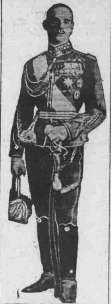
GRAND DUKE MICHAEL