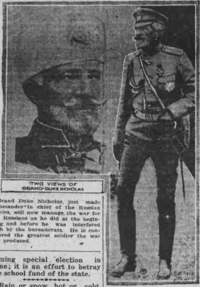
TWO VIEWS OF GRAND DUKE NICHOLAS

Grand Duke Nicholas, just made commander-in-chief of the Russian army, will now manage the war for the Russians as he did at the beginning and before he was interfered with by the bureaucrats.