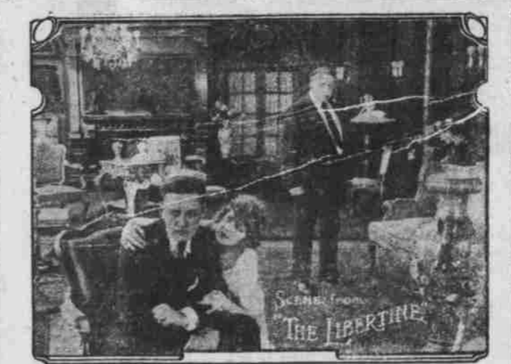
ALTA THURSDAY AND FRIDAY.

29 HARVARD MEN DIE AT FRONT Sixteen Were Killed in Action, Says University Report. CAMBRIDGE, Mass., March 21.—Twenty-nine alumni of Harvard university have died as a result of the European war, according to statistics made public today. Sixteen were killed in action.