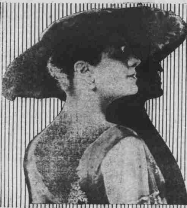
VALESKA SURATT—Direction William FOX APPEARING TODAY IN "THE NEW YORK PEACOCK" PASTIME.